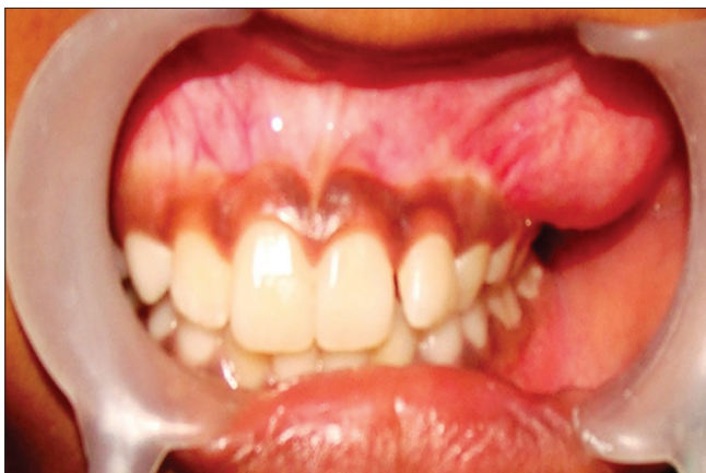
Figure 2: Intraoral photograph showing buccal extent of the lesion