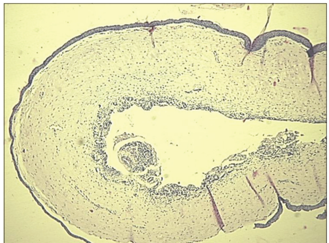
Figure 4: Histology showing a cyst filled with keratin, and lined with uniformly thin parakeratinised epithelium with a prominent palisaded basal cell layer