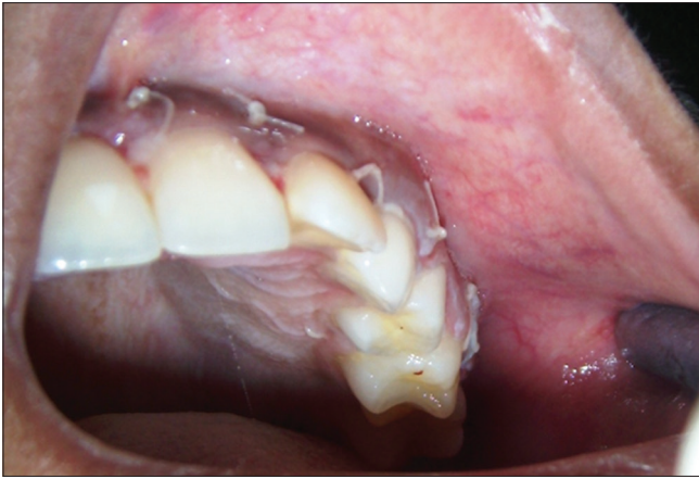
Figure 5: Intraoral photograph 8 days after surgery showed uneventful healing

roentgenograms and clinically usually do not reveal the true nature of the lesion. 5