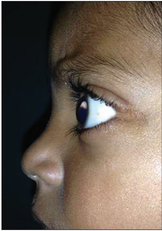
Figure 1: Proptosis