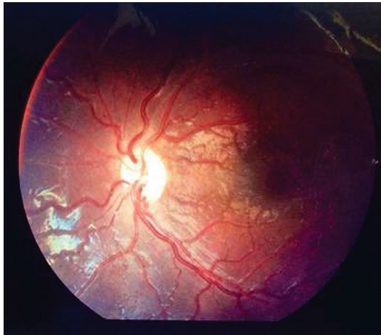
Figure 2: Partial optic atrophy with venous tortuosity